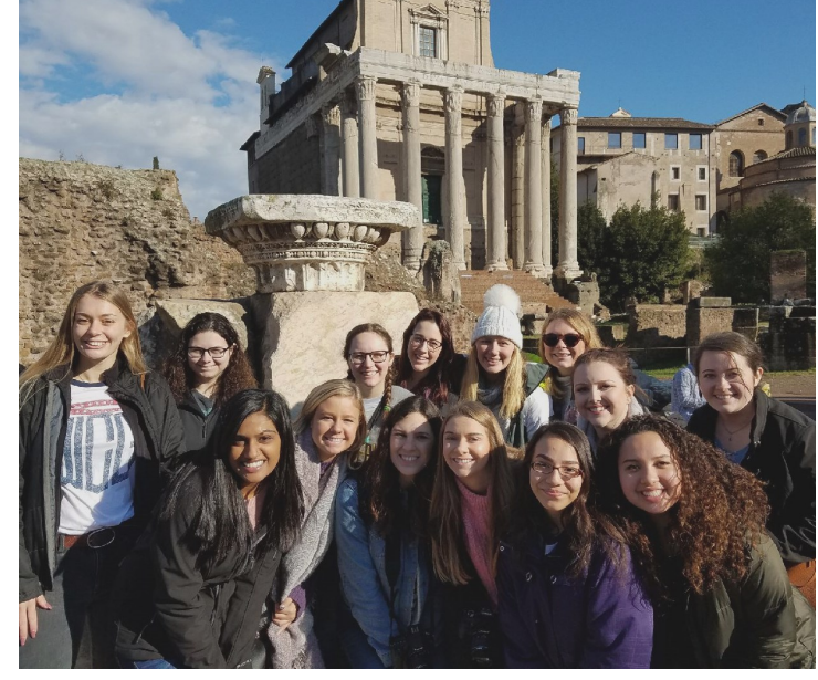
Students on the COMM to Florence Wintermester Trip 2019.

r. Crick frequently serves as an instructor for facultyled study abroad programs; in fact, he recently returned from Florence, Italy as part of the Winter 2019 program. Dr. Crick shared three main values that are gained as a result of studying abroad: educational values, cultural values and social values. From a learning perspective, studying abroad offers an advantage, allowing students to perceive how history, ideas and practices isolated in books in the traditional classroom have concrete substance in the real world. Students actually encounter material as living objects and practices rather than simply reading about them. Studying abroad also allows students to become immersed in a different culture, helping them to understand the values and habits of a different people, as well as gain outside perspective on one's own culture. "The study abroad experience uniquely offers students the opportunity to experience the emancipation that comes from immersive cultural difference, while showing as no other experience can, how history, art, and ideas are alive and